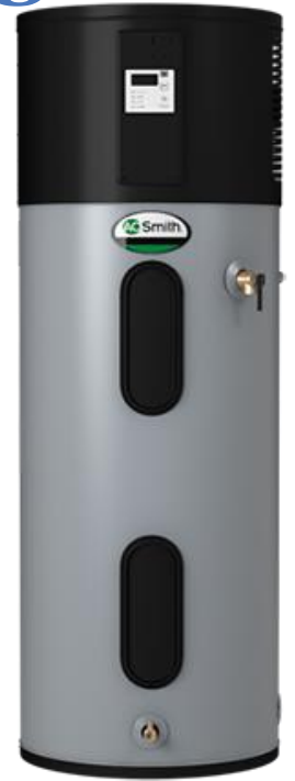
Low-temperature heat pump